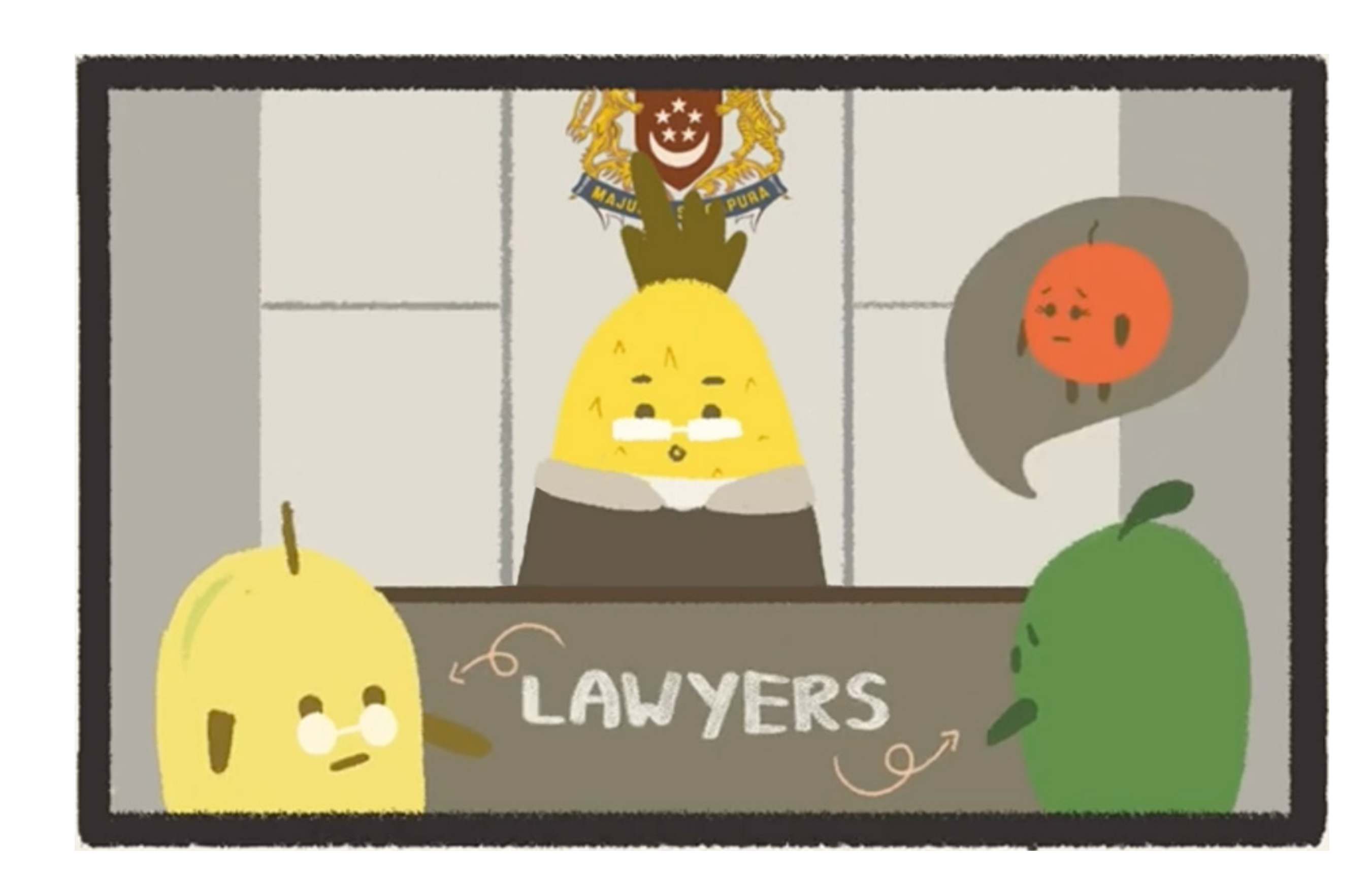
A YouTube video produced by the FJC shows a young character, Emily, being shown around the premises.

This is a free resource that family lawyers and parents may wish to tap on to prepare children who need to attend court at the FJC.