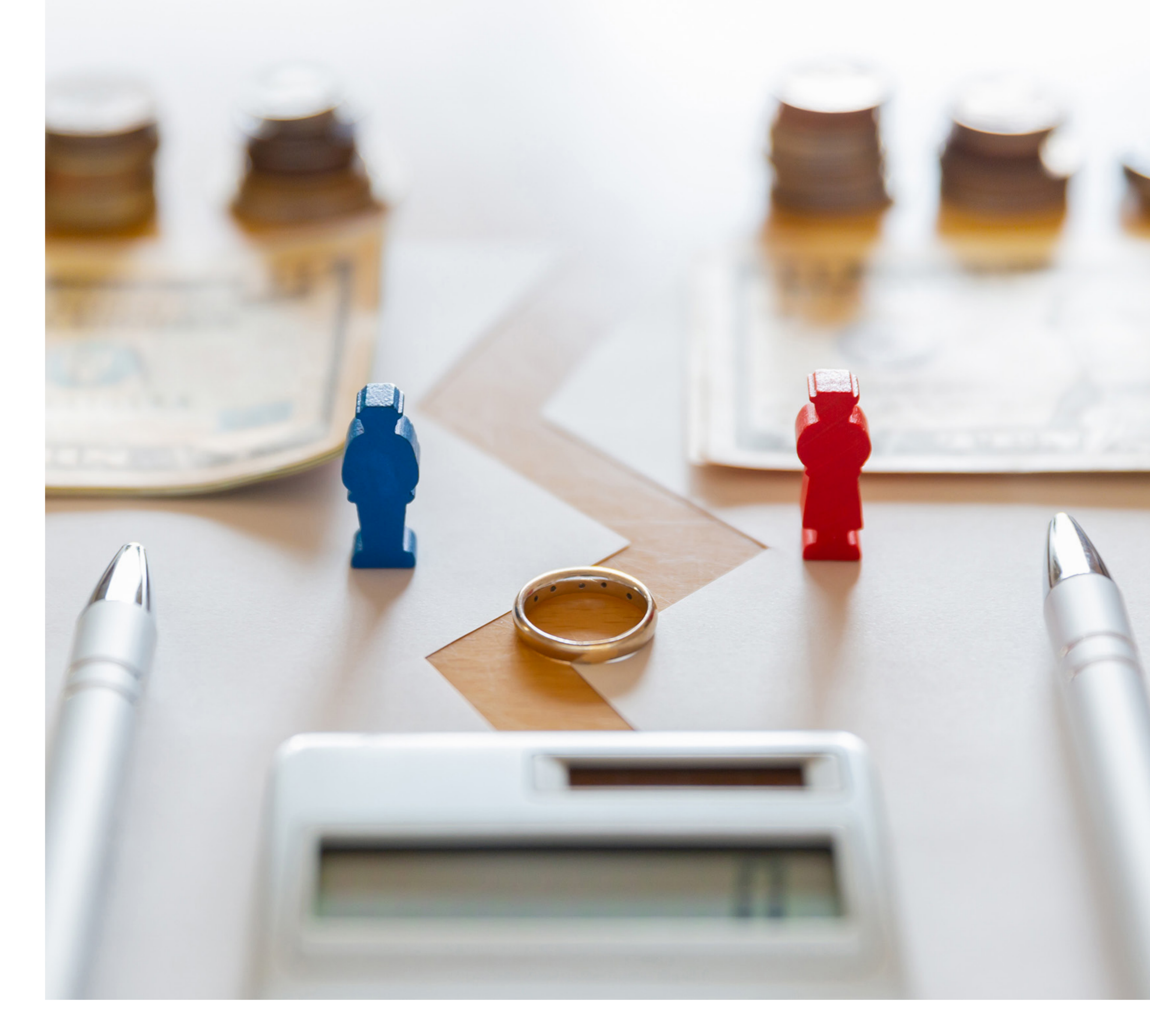
FNE seeks to help parties undergoing divorce proceedings reach a consensual settlement of their disputed financial matters.

The ARC will continue to work closely with the FJC to operationalise TJ more fully in the family justice system.