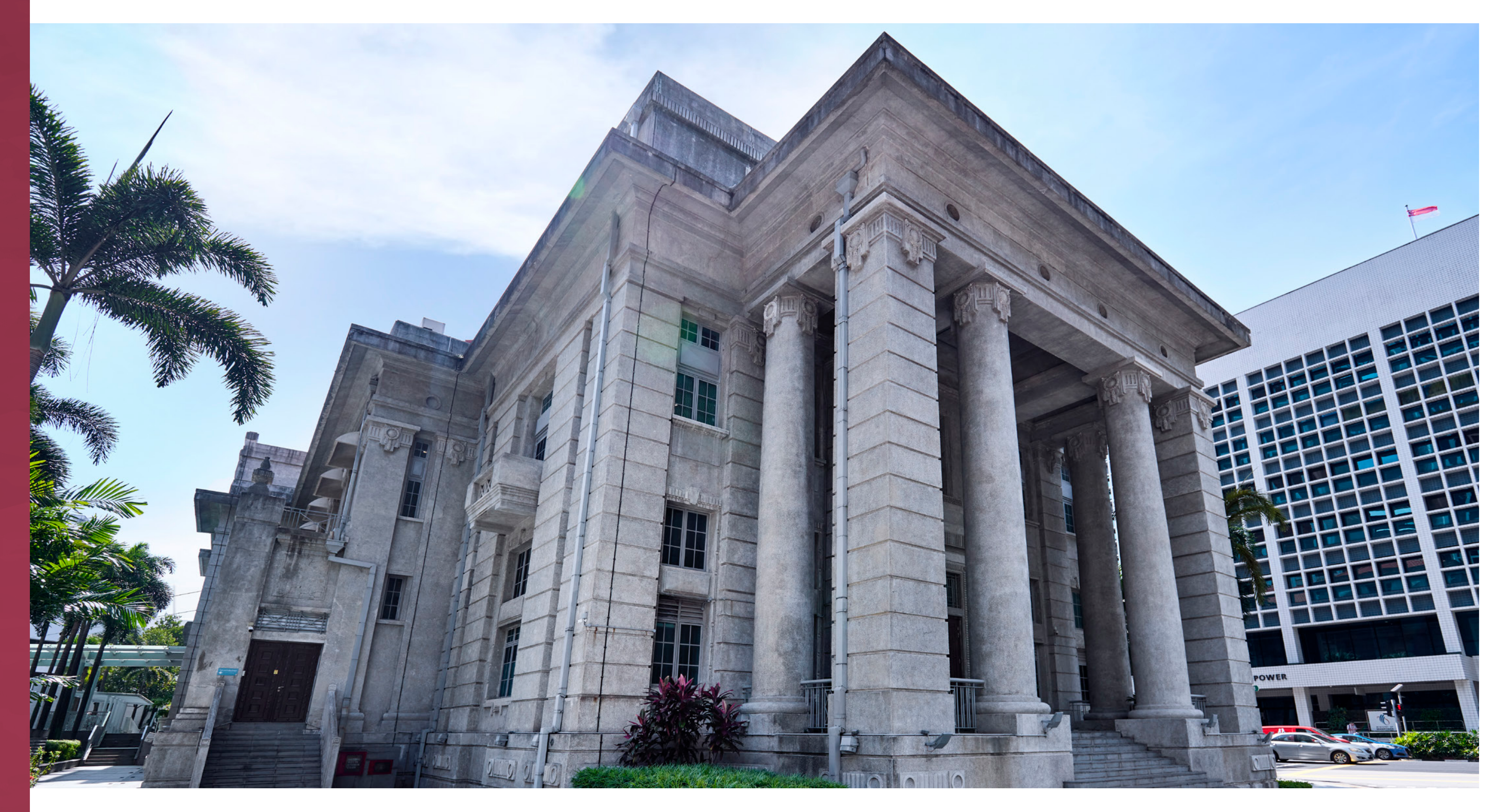
The FJC is ramping up efforts to bolster the adoption of therapeutic justice in family law.

he Family Justice Courts (FJC) established the Advisory and Research Council (ARC) on Therapeutic Justice on 1 July 2020. Comprising leading international Therapeutic Justice (TJ) experts, the ARC was formed to assist in the FJC's efforts to adopt and advance a TJ approach to family justice and practice.